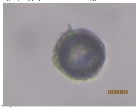
Fig.(1) Toxocara spp. Egg