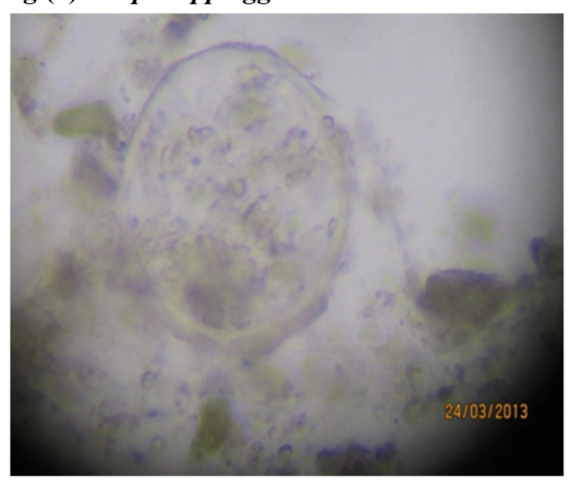
Fig.(3) Dipylipidum caninum egg.