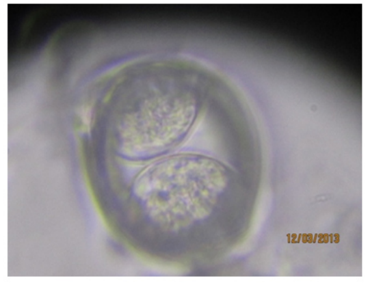
Fig.(2) Isospra spp.egg.