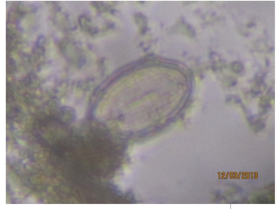
Fig.(5) Strongyloides spp. egg.

Diagnosis of eggs parasites were comprises following species, Toxocara spp. Fig.(1), Isospra spp. Fig.(2), Dipylipidum caninum Fig.(3), Mesocestoides spp. Fig.(4), Strongyloides stercoralis Fig.(5) Taenia spp. and Echinococcus spp.